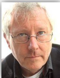
Jürgen Klute - ©European Parliament

A CUT delegation travelled to Geneva for the 103 rd ILO International Labour Conference to insist that Colombia be included in the list of the countries examined specifically, to assess among other things, the implementation of the recommendations from their mission to Colombia in February 2011. Colombia once again found itself among the list of 25 cases to be considered by the ILO. During the same conference, the presidents of the CUT, CGT and CTC presented serious breaches by the Colombian government of its obligations under the Convention 81 relating to inspection at work.