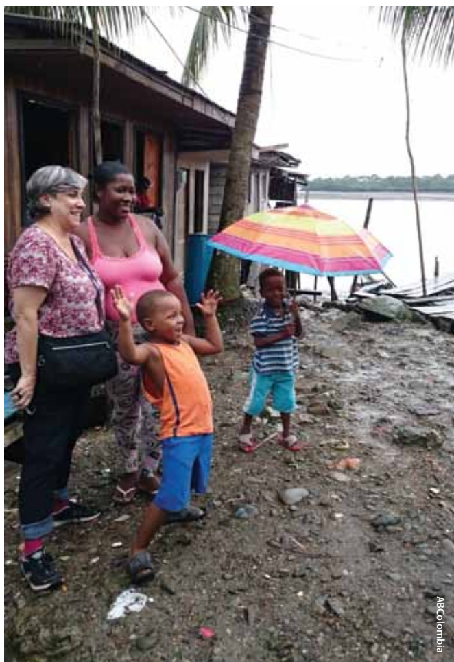
Puente Nayero Humanitarian Space

way of life and leave them without a viable livelihood. Instead they are asking to be incorporated into the planned development of the area.