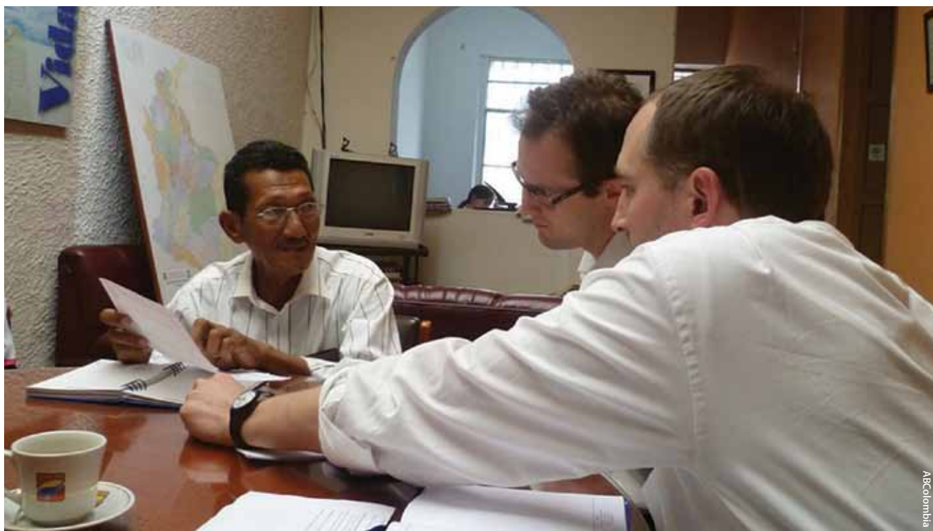
Community Leader with British and German Embassy Representatives