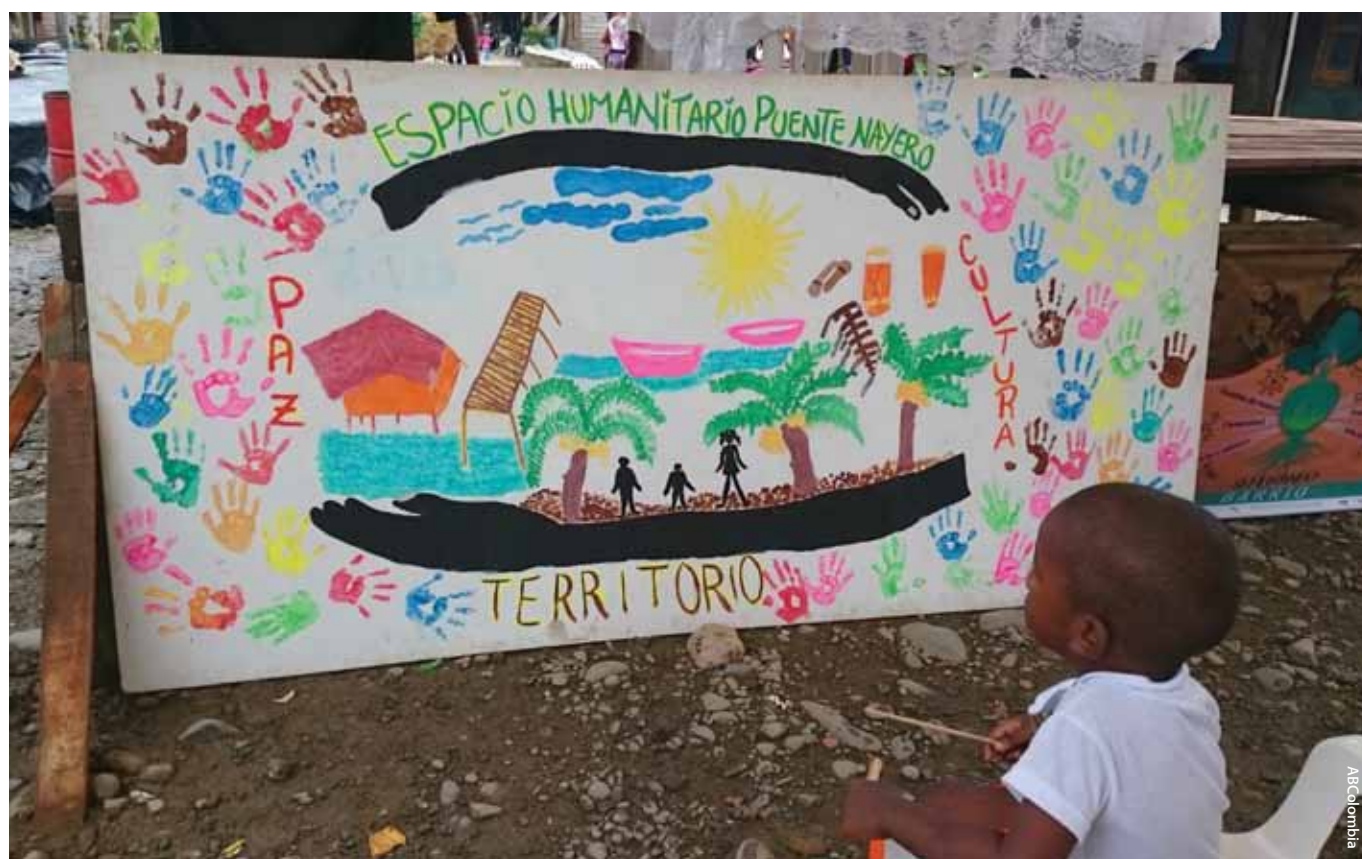
Children of the Puente Nayero Humanitarian Space put a hand print on this picture as a commitment not to be violent; they gave up their toy guns in exchange for musical instruments

The Puente Nayero Humanitarian Space, located in the neighbourhood of La Playita in the town of Buenaventura, is a series of waterfront streets where houses are on stilts in the sea with raised walk ways. The Afrodescendent community live off artisanal fishing and logging. The State authorities want to remove these communities from the area to make way for a modern development with hotels and cafés that is being constructed along the whole of the waterfront. This would impact on the community's traditional