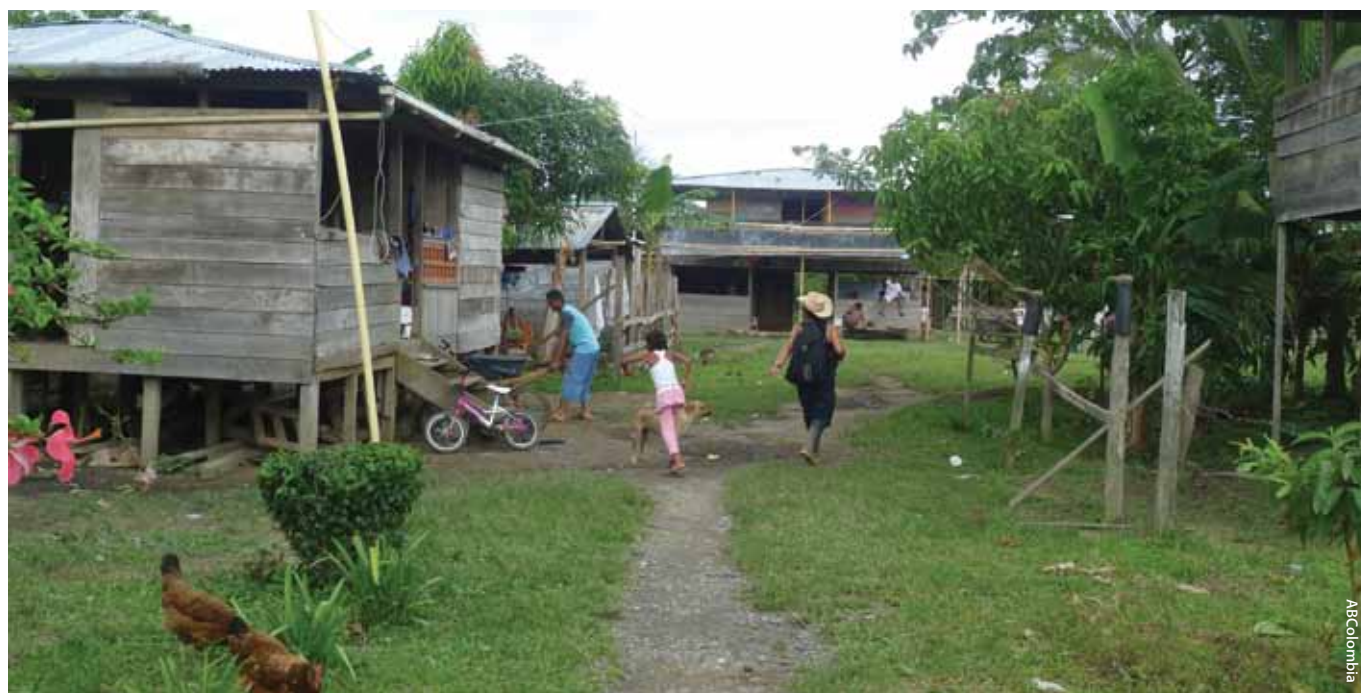
Curvaradó community threatened by agro-industry

The UN-OHCHR points out that whilst urban HRDs have seen changes in attitude, particularly in the case of the Security Forces, this is not the situation in rural areas where 'many rural HRDs still confront hostility and a "counter-insurgency construct"'. 40 This counter-insurgency construct means that rural defenders continue to be viewed by many state actors as 'enemies of the state' resulting in greater vulnerability, including to judicial persecution. According to the UN-OHCHR, 'criminal investigations of community leaders for their alleged connection with armed groups, despite insufficient grounds for prosecution, [are] recurrent.' 40