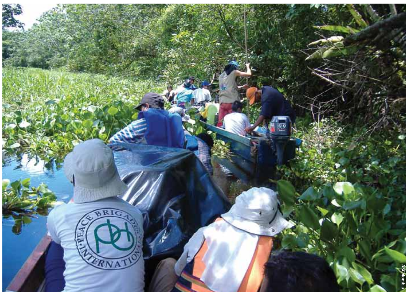
National and International Accompaniment of HRDs in Chocó

their rights, to denounce corruption and all other forms of violence. '...As a result [of strengthening the organisational capacity of the ethnic-territorial organisations] communities were able to denounce threats that came from ... companies and their activities and claim their rights.' 69 In the case of mining companies the Diocese sought experts from national Colombian CSOs, academic institutions, and from international organisations to give the communities the information they needed to collectively establish their position and take concrete actions in order to be able to remain in their territory.