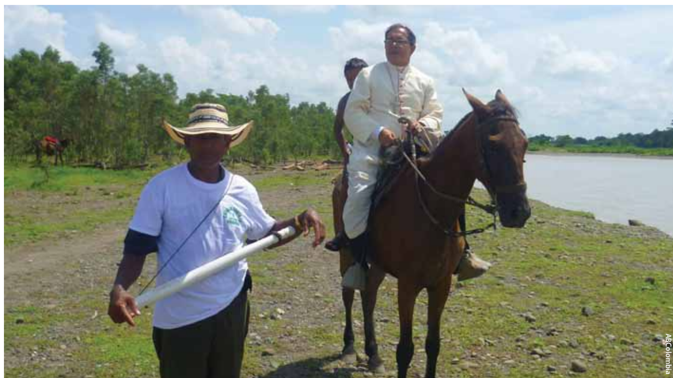
Bishop of Montelibano accompanied by the Zenú Guardia Indígena

The Zenú community have also been engaged in efforts to obtain legal recognition of their ancestral territories 64 , as well as, raising the issue of the alleged impacts of the nearby South 32 Cerro Matoso ferronickel mine and processing plant on the health of the Zenú People and the alleged contamination of the environment. 65