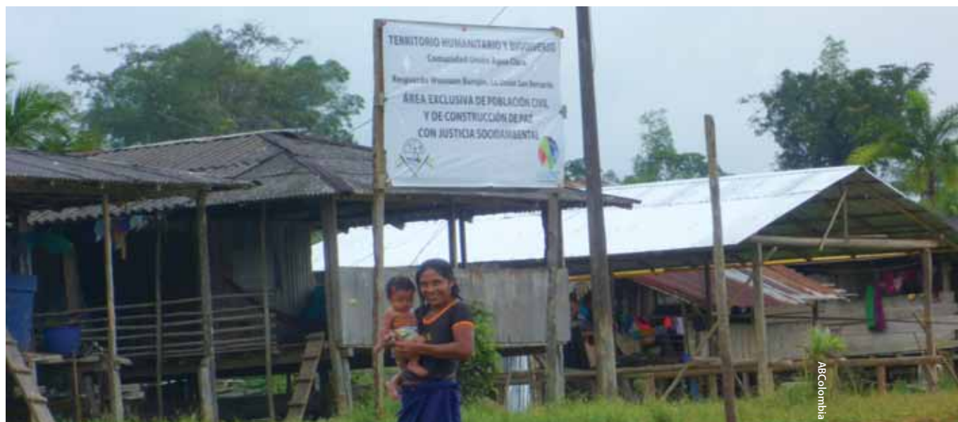
Sign reads: Wounaan Humanitarian and Biodiversity Zone - Area exclusively for the civilian population and the construction of peace with social and environmental justice

As communities see the difference that HZs make to the security of the community and its leaders they are beginning to adopt this self-protection model for themselves. Many communities have started to form Humanitarian and Biodiversity Zones. These have grown in number throughout the Peace Talks, for example, in area like the San Juan River with the Wounaan Indigenous Peoples. Communities see these HZs offering security and protection even after the signing of a Peace Accord.