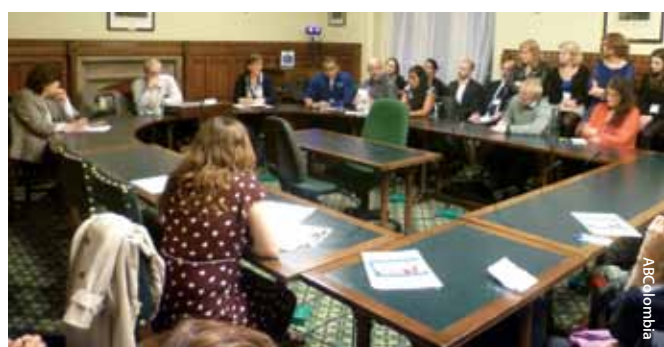
Leaders from Curvaradó in UK Parliament

The National Protection Unit (Unidad Nacional de Protección–UNP) provides protection measures for HRDs but it has only a limited role in the security of HRDs, in that it only offers protection and not preventative measures . Whilst this programme has saved the lives of some, and rural defenders have benefitted from its provisions, it has major weaknesses, this is especially true in the case of rural defenders. Some of the serious weaknesses include not being designed to respond to: the local rural context, the differential needs of minority groups and women, or take into account the factors generating risk. Their measures, until very recently, have been directed at the individual rather than collective – that is, designed to protect a whole community or organisation. They have also offered measures that were more suited to urban rather than rural settings. 44