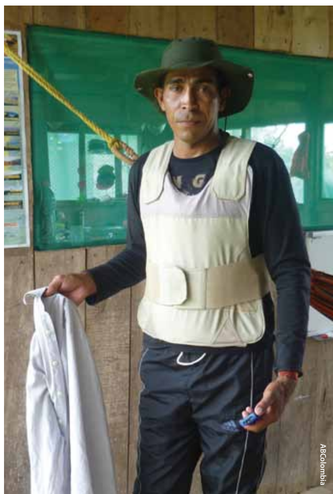
Human Rights Defender in bullet-proof vest given to him by the State National Protection Unit

Another effective prevention measure would be to focus on the economic and political structures of the paramilitary groups. The majority of killings and attacks against HRDs come from right-wing paramilitary groups. CSOs have been insisting for years that the only way in which to effectively dismantle the paramilitaries is to prosecute the authors and financiers of the crimes. Despite years of insistence there had been no comprehensive plan for achieving this - that is until June 2016.