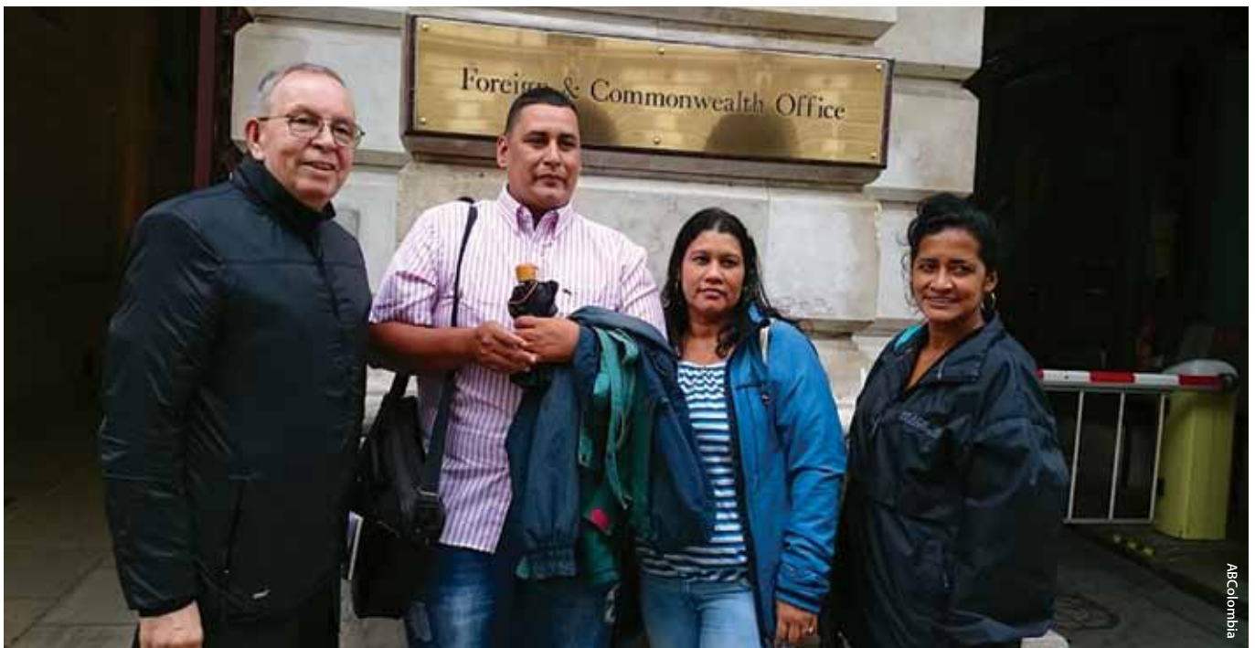
Human Rights Defenders meet with UK Foreign Office to discuss Colombia

The information in this report comes from interviews and conversations with local partners of ABColombia members, as well as, from other Colombian NGOs and some inter-governmental organisations working on the ground in Colombia. The self-protection models in this report are ones that partners of ABColombia members have developed. They focus in the main on rural areas, but they are not an exhaustive list of all the self-protection mechanisms used in Colombia.