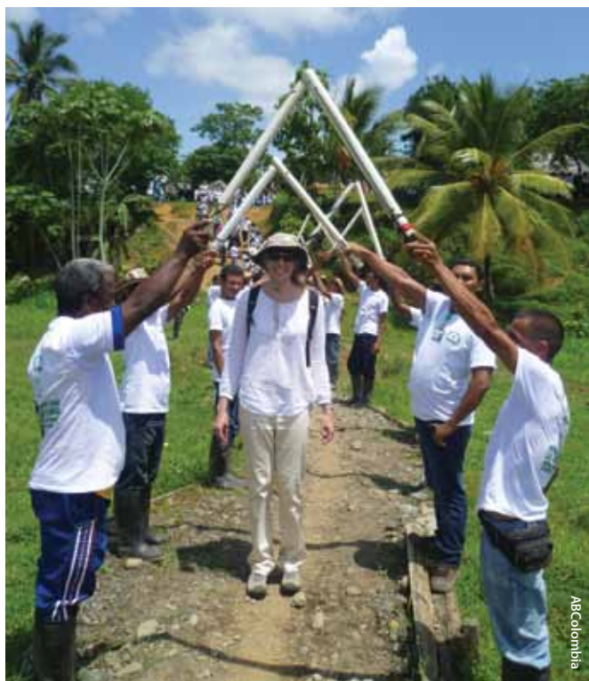
Guardia Indígena welcome UK embassy to the Alto San Jorge Resguardo of the Zenú Indigenous Peoples

'The protection strategy of the government is only a military one. We need protection to be integrated incorporating psychosocial and spiritual as well as physical. For example, if we receive a threat, then [others] enact a ritual to protect us, which gives us strength. Then the next day we are more relaxed to design a protection strategy ...' 61