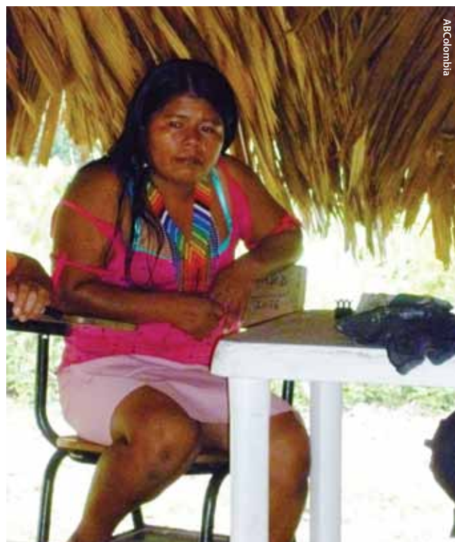
Wounaan Indigenous Governor

They also use measures that are widely practised to ensure safe mobility, such as, making changes to their normal routines, activating communication networks, working with International and National solidarity organisations whose focus is the protection of women, and in the case of Indigenous Peoples accompaniment from the Guardia Indígena .