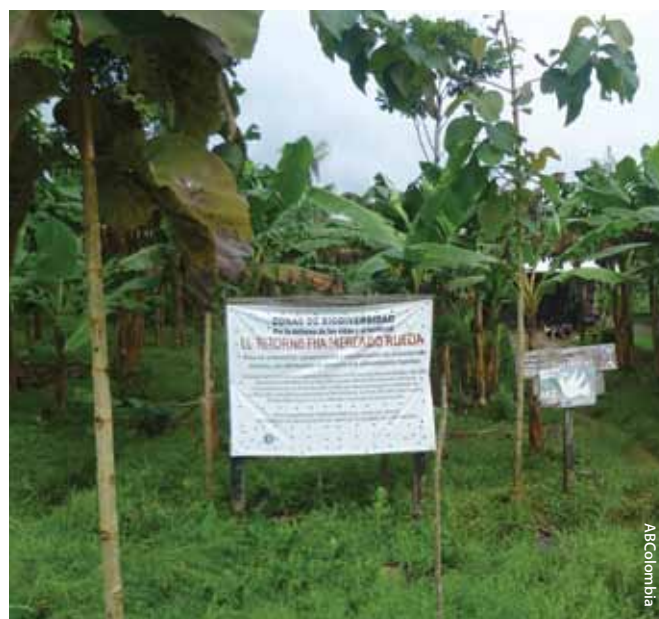
Collectively owned land of Pedaguita Mancilla Community. The sign reads: Biodiversity Zones for the defence of territory

Over the period of the conflict communities started to realise that there were economic interests behind the land grabs. It is, therefore, not surprising that communities living on collectively owned land in Colombia: Indigenous Peoples ( Indigenous Resguardo ), Afro-descendants ( collectively owned territory under Law 70 ) and Peasant farmers ( Peasant Farmer Reserves ) when devising self-protection measures had at the heart of these their territory and its biodiversity. The models looked at here are some that ABColombia members' partners have developed.