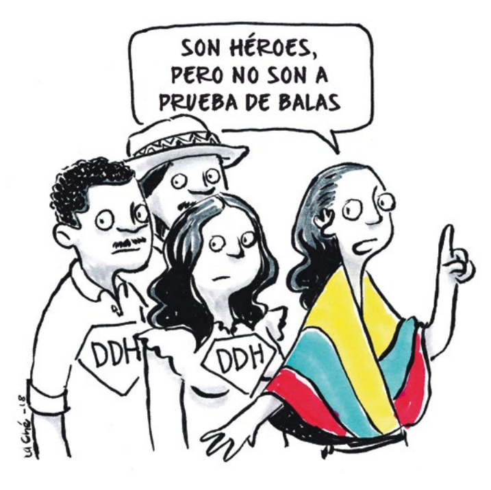
"They are heroes but they are not bulletproof"

and political measures aimed at respecting and guaranteeing the Human Rights of all citizens of Colombia. In addition to actions that have been developed as part of the implementation of the aforementioned Peace Agreement, aimed at addressing this reality, some of the prevention and protection measures that deserve to be highlighted and that have been adopted in the last year will be mentioned briefly below.