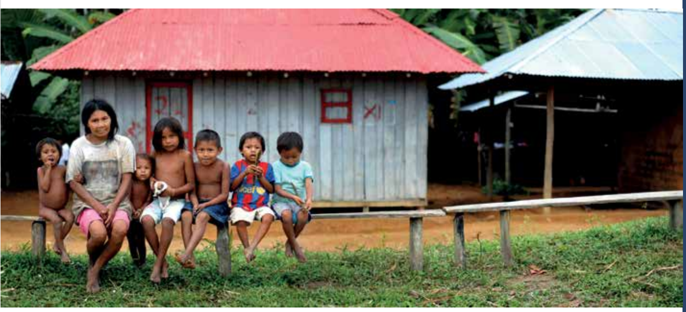
Upper Negro river basin, Amazon, Jupda, 2013. Juan Pablo Gutierrez

36. During the period examined, several extractive megaprojects were reportedly implemented without having effectively complied with the obligations resulting from the fundamental right to prior consultation in the Colombian Constitution<sup>36</sup>.