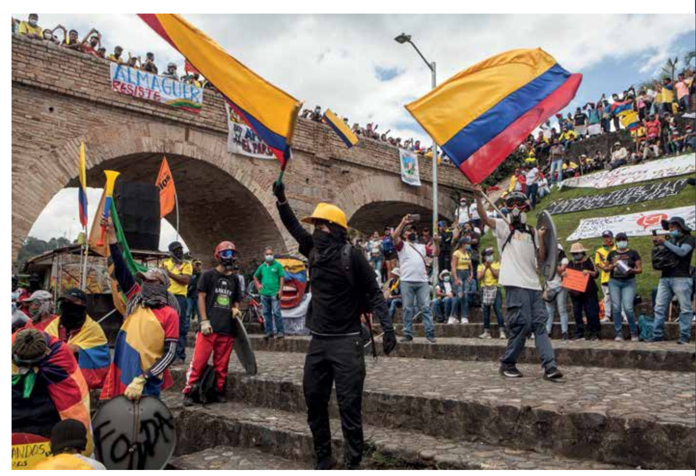
Day 30 National Strike 2021. Popayán, Cauca. Javier Sulé

71. Between 2019 and 2021, Colombia experienced the largest citizen mobilizations in four decades<sup>70</sup>. Repressive and militarized responses and serious violations of freedom of assembly and expression by state agents were reported<sup>71</sup>. According to the United Nations<sup>72</sup> and the Inter-American Commission on Human Rights (IACHR)<sup>73</sup>, the security forces resorted in a generalized, arbitrary, indiscriminate and disproportionate manner in their use of force against demonstrators, including the premeditated use of firearms<sup>74</sup>.