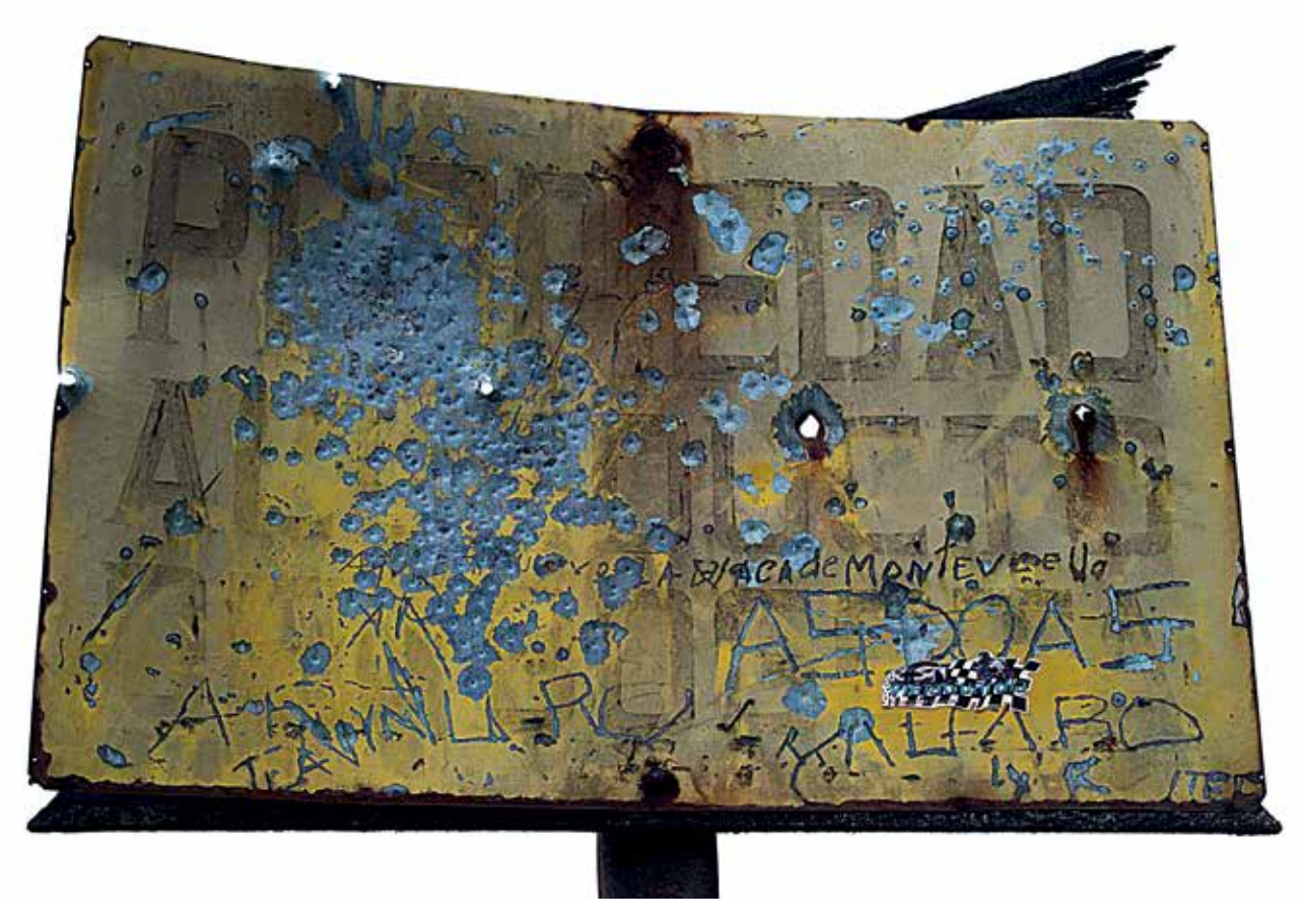
Sumapaz Paramo, 2020. Myrto Hatzigeorgopoulos (@MyrtoHV)